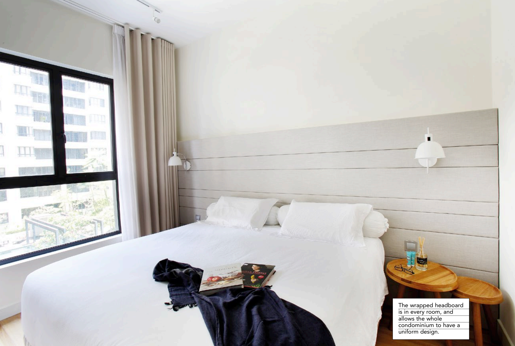
The wrapped headboard is in every room, and allows the whole condominium to have a uniform design.