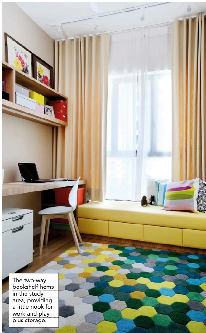
The two-way bookshelf hems in the study area, providing a little nook for work and play, plus storage.

One of the first things done is to design a double-sided bookshelves as the divider wall in the play area. The “book wall”, as they call it, can be used on both sides and is a subtle way of adding feature without having to sacrifice too much space. It’s a two-in-one solutions which works pretty well in small spaces. >