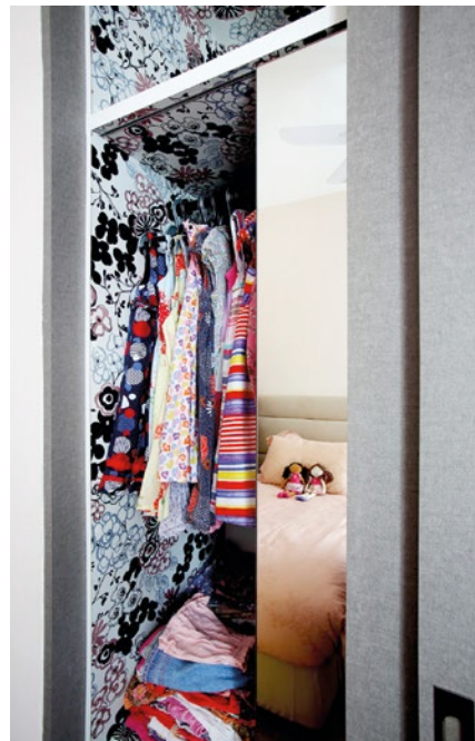
top & right: The wardrobes feature a hidden sliding mirror. Bottom: The girls' bedroom has the same wrapped headboard, but in hues of pink.