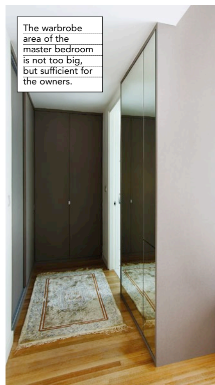
The wardrobe area of the master bedroom is not too big, but sufficient for the owners.

NATURAL LIGHT THE MASTER BATHROOM HAS LOUVRES THAT CAN BE CLOSED FOR PRIVACY, AND LETS IN LOTS OF SUNLIGHT TO PREVENT DAMPNES.