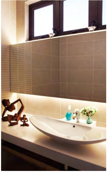
left Surfaces were kept crisp, smooth and geometric. above Touches of elegant functionality dons the washrooms.