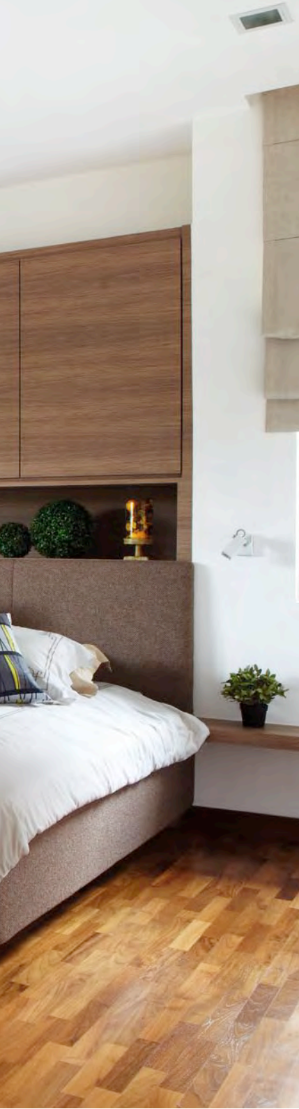
above low lighting and dark hues for the master bedroom. Tray from Aino. right The study area stores more personal belongings, hidden away on the topmost floor. Storage baskets from Aino.