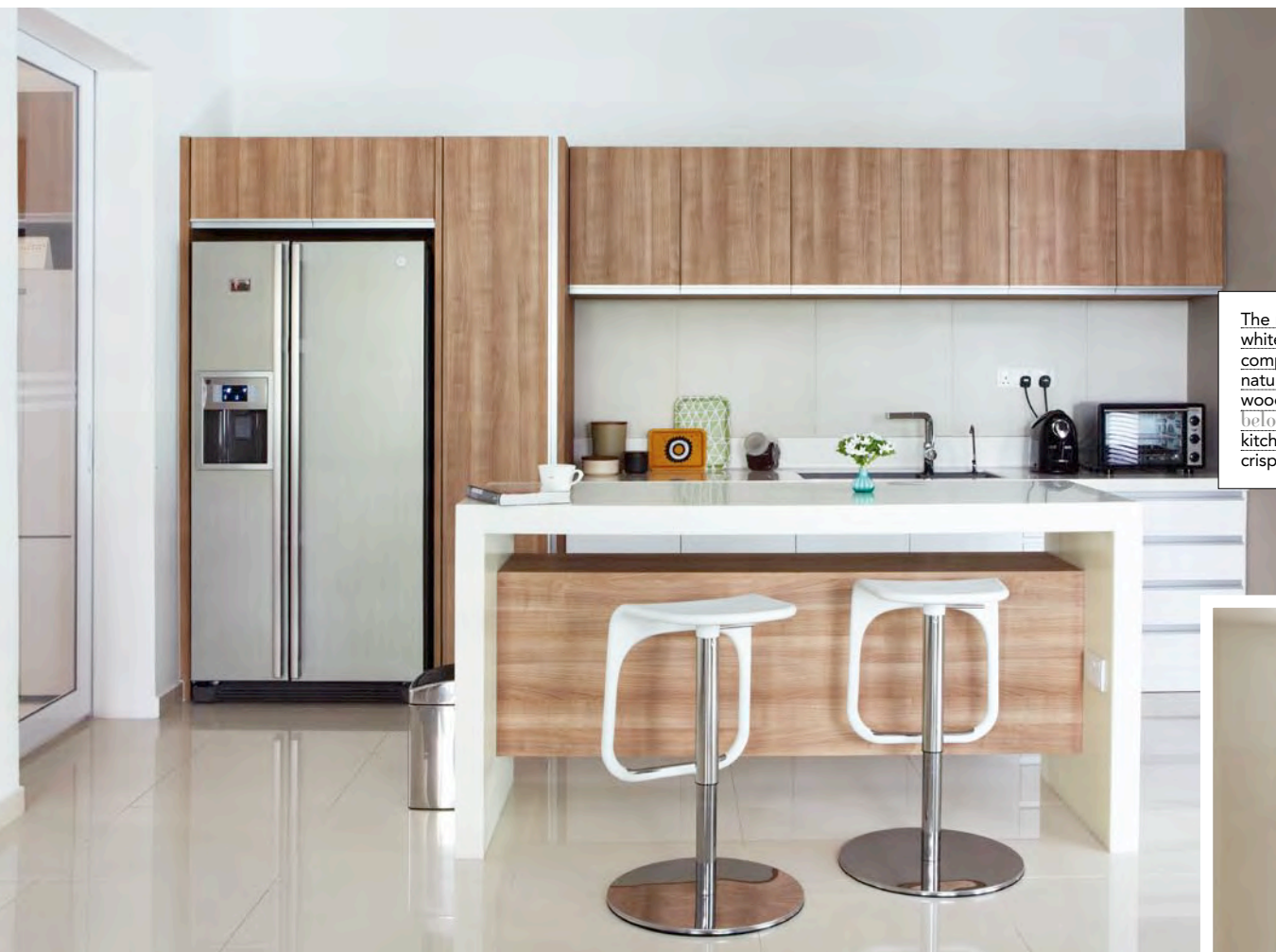
The minimalist white colour is complemented by the natural hues of sleek wooden surfaces. below The wet kitchen is kept equally crisp and clean.