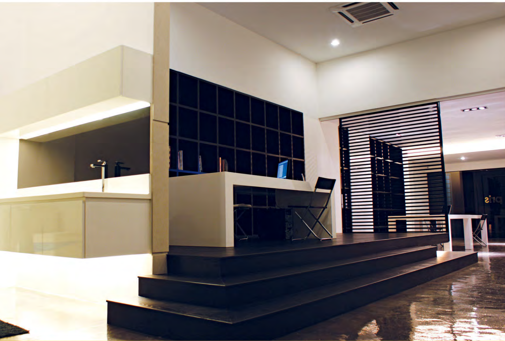
• Linking the black and white setup at the front, this area is elevated by stairs, an interaction of different levels, same color schemes. / 连贯前方的黑白格局，这里由楼梯托高，呈一幕同色系且不同阶级的空间对话。

[ Paul+Pris ] Interior Designer / 5yrs Experience