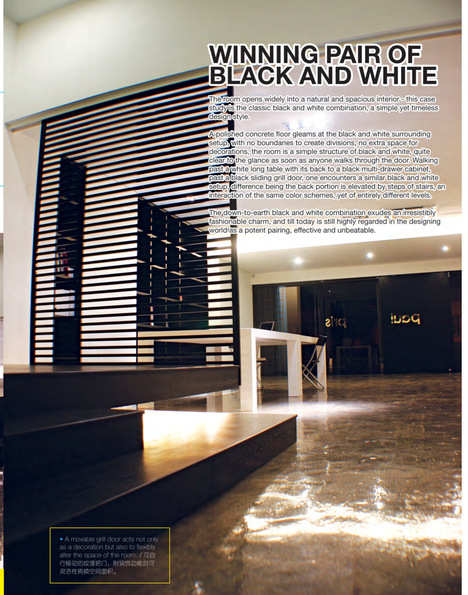
• A movable grill door acts not only as a decoration but also to flexibly alter the space of the room. / 可自行移动的纹理把门，附装饰功能且可灵活性转换空间面积。

The down-to-earth black and white combination exudes an irresistibly fashionable charm, and till today is still highly regarded in the designing world as a potent pairing, effective and unbeatable.